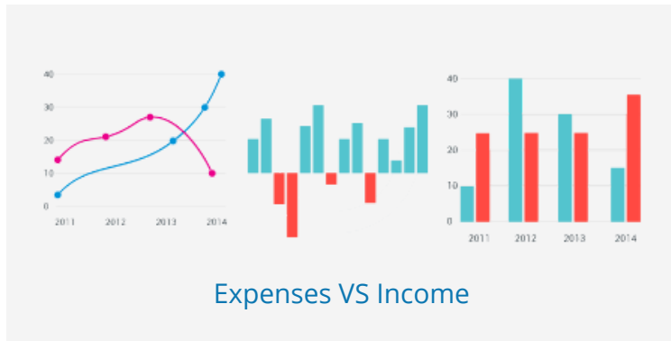
Expenses VS Income

TOMS Business Performance Management gives you a real-time window into your company's business process behaviour and operational effectiveness, so you get to see and know how your organization reacts with speed and effectiveness to deliver optimum performance. By dynamically charting the right performance metrics at the right time, TOMS gives you a quick visibility into performance issues. Transparency is increased as strategic, tactical and operational measurements are communicated through graphical dashboards and icons to the people that need them.